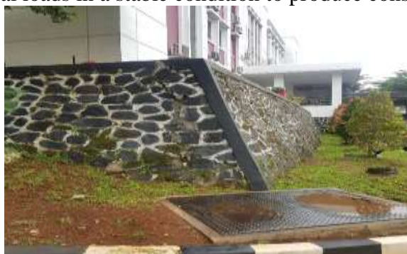
Figure 3. Cracks in the Dam of the Deanery Building of the Faculty of Defense Strategy

Structural components can be seen from foundations, beams, and columns. The Defense University building has a foundation system under the building. This foundation can withstand various horizontal and vertical loads in a stable condition to produce construction stability.