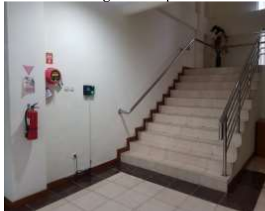
Figure 7. Fire Extinguisher in the Dean's Building of the Faculty of National Security, University of Defense

The Defense University building has a fire extinguisher on each floor. Fire extinguisher is one of the safety requirements of a building to anticipate a fire.