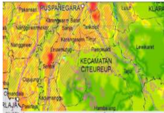
Figure 2: Earthquake Hazard Map of Citeureup Sub-district, Bogor District

From the map above, it can be seen that Citeureup sub-district which is the administrative area of the Defense University has a high vulnerability marked by many red and yellow areas indicating that the area is prone to landslides because it is located on a fairly high ground although based on its location, the Defense University is at a point that is not directly affected by landslides.