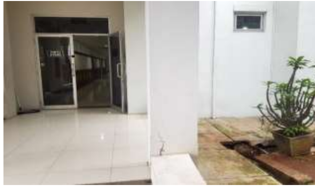
Figure 4. Cracks in the Columns of the Defense University Auditorium Building