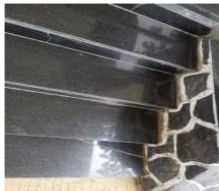
Figure 6. Floor Cracks in the Auditorium Building of the Defense University

The Defense University building as a whole has floors that are free of cracks and floor tiles that are all intact.