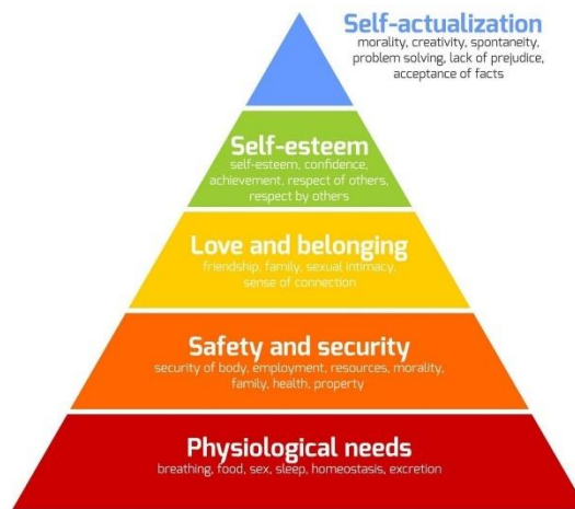
Illustration 1: Maslow's Human Needs Hierarchy Theory

constant and long-lasting condition of peace. Emphasizing on process in first achieving and then maintaining the peaceful condition, therefore closely related with positive peace.