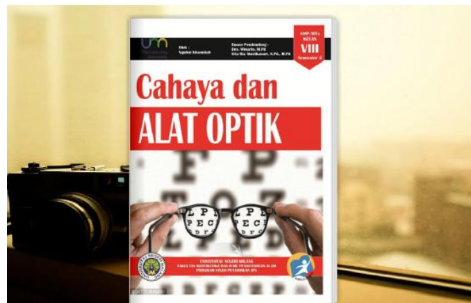
Figure 1. Front page of interactive digital teaching materials

Figure 1 is the cover of teaching materials used in social studies learning with discovery learning model. On the front page displays the title of the material and the name of the author. An example of the content of interactive digital teaching materials can be seen in Figure 2.