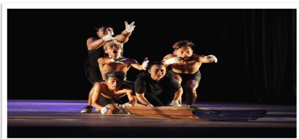
Figure 4: The atmosphere of struggle to live a better life.

The final section focuses on the struggles of Bipolar Disorder survivors to survive with all sorts of feelings they can't control, accept themselves and love themselves more. Resignation is one of the best alternatives to face. Getting closer to positive things will help for relaxation and catharsis for the better.