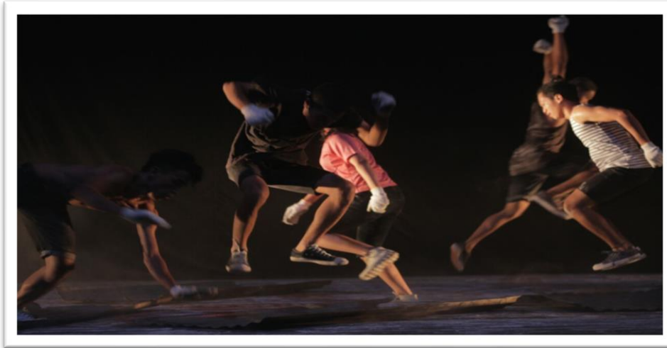
Figure 1: Some dancers are doing group movements, doc: Fabio Yuda

movements. Solo dancing is quite an interesting expression because it uses more exploration and gymnastic techniques.