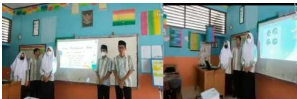
Figure 6. Group work presentation

In the third stage of product differentiation learning, the activities carried out at this stage are students presenting the results of their group work in front of the class. This can be seen in Figure 6.