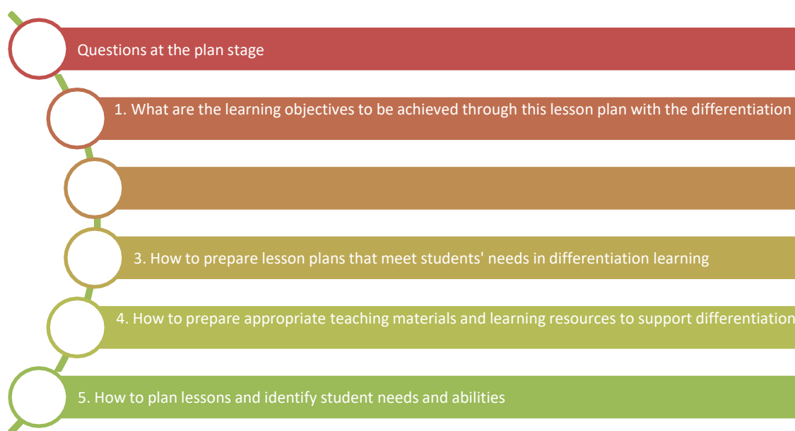
Figure 1 . List of stage plan questions

In the first stage, planning (plan) aims to produce learning designs that are believed to teach students effectively and generate student participation in learning. Lesson planning can be divided into three stages. First, the teacher must identify the desired outcome. Next, the teacher determines acceptable evidence. Finally, teachers plan learning and teaching experiences (Dee, 2011). Talking about planning means we also talk about preparation. In differentiated learning, readiness becomes one of the learning needs of students. As for the results of interviews conducted with eight mathematics teachers regarding the planning carried out in differentiation learning. The questions asked during the interview can be seen in Figure 1: