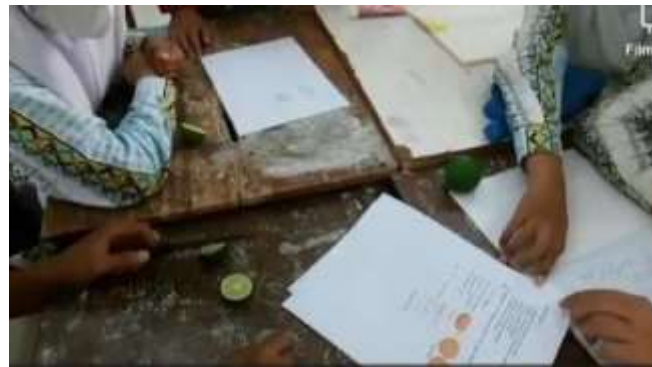
Figure 5. students work in groups

According to the mapping, the worksheets (LK) provided are different for each group. Group A is given worksheets containing questions with great difficulty; Group B is given worksheets containing intermediate-level questions; Group C is given worksheets containing questions with a low difficulty level to be worked on; this can be seen in Figure 5.