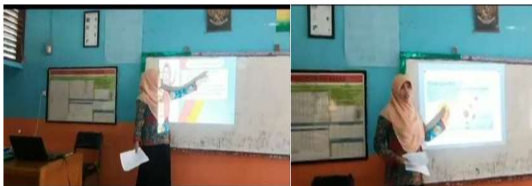
Figure 4. The teacher performs process differentiation

When the teacher applies the learning process at school, it can be seen that it consists of content, processes, and products in differentiation learning. The content differentiation learning can be seen in Figure 4: