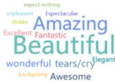
Figure 2. Keyword Cloud Map

Firstly, attention is the act of focusing one's mental activity or consciousness on a certain object. The increase in audience attention to the opening ceremony of the Winter Olympics is reflected in the fact that at the beginning of the ceremony, spectators from different national regions around the world began to allocate their attention resources to the opening performance.