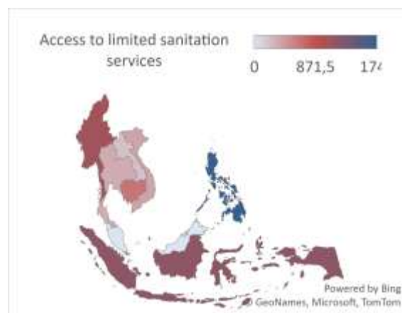
Figure 4. Access to Limited Sanitation Service

To address the existing disparities in access to basic sanitation services, it is vital for all ASEAN countries to prioritize and invest in comprehensive sanitation improvement initiatives. Governments and relevant stakeholders should develop and implement robust policies, action plans, and funding mechanisms to accelerate progress in this area. This includes investing in the development of sanitation infrastructure, particularly in underserved and marginalized communities, and ensuring that sanitation services are affordable and accessible to all.