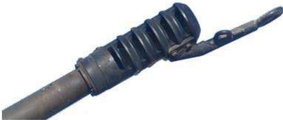
Figure 2. Material Object of Brake Muzzle/Barrel

Further adding to the sophistication of the design, attention is drawn to the two side holes from the first row, ingeniously angled forward. This specific feature serves a dual purpose by strategically mitigating the impact of high-pressure and high-temperature propellant gas on the rear side of the muzzle brake. The forward angling of these side holes cleverly redirects the gas through the adjacent openings, contributing to a controlled and efficient dissipation of pressure. In essence, the detailed examination of the muzzle brake's structure, with its multiple baffles, precisely arranged perforations, and strategically angled side holes, underscores the dedication to achieving not only optimal performance but also addressing specific challenges associated with high-pressure and high-temperature gas release. This insightful analysis adds depth to our understanding of the meticulous engineering involved in muzzle brake design, showcasing a commitment to enhancing firearm functionality and user experience.