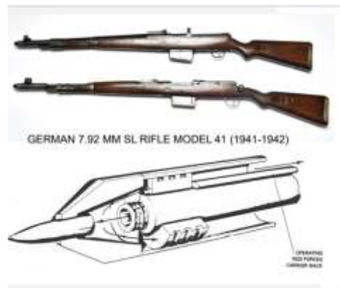
Figure 1. SL Rifle 41

Delving into the operational mechanism of the firearm, as depicted in Figure 1 showcasing the SL Rifle 41, we observe the utilization of a direct gas impingement system. In this configuration, gas extracted from the barrel is channeled along a tube to directly influence the cover assembly, facilitating its opening. This system, despite its drawbacks, offers distinct advantages such as simplicity, cost-effectiveness, and a lightweight design. However, a noteworthy drawback emerges as carbon particles tend to accumulate around the cover assembly area and solidify during the cooling process.